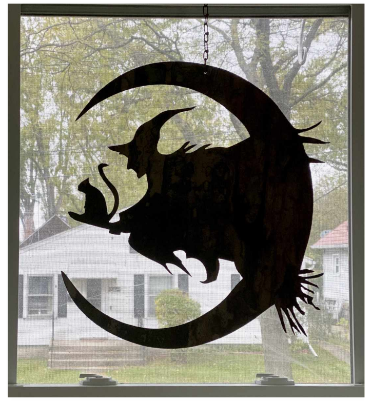
Fabricated tin witch art, purchased during Fall Art Tour and now decorating our front window. We figure that if THEY want to start the Christmas season at Halloween, WE can extend the Halloween season to Christmas.

[SC] It has also been a grey and rainy fall out here and Jeanne and I have had to make an effort to go out and embrace the beauty of autumn when the sky clears and