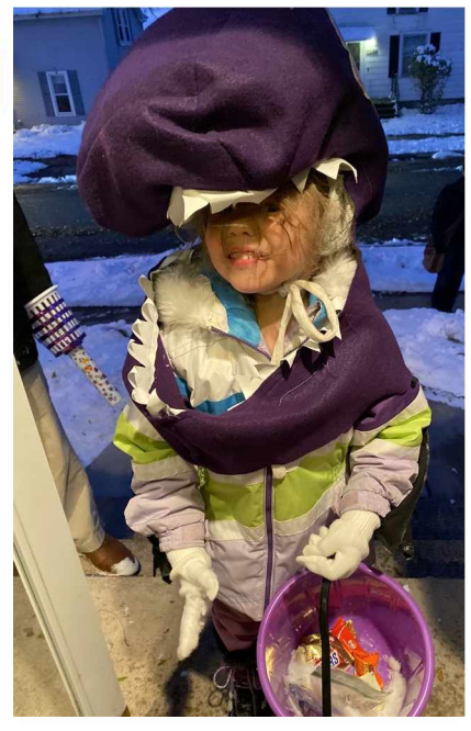
Trick-or-Treater-tired, wet and cold

[SC] We had about 40 kids show up at Halloween this year, down from nearly twice that number last year. It may have something to do with the nearly four inches of snow we got the night before, along with plunging temperatures as the sun went down on trick or treat evening. We may share a few pictures in the apa that we rushed to take on Jeanne's new iPhone, which is quite good at taking shots in various qualities of light. I think if we want better pictures, we have to refine our approach. Too often we started asking about taking a picture AFTER the kids got the candy. Once they get the prize, they